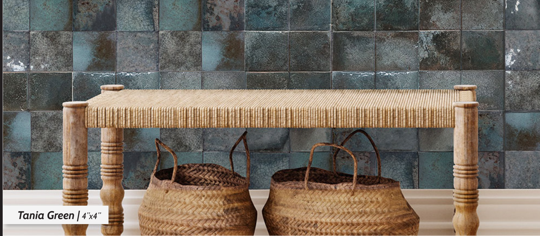
Tania Green | 4"x4"