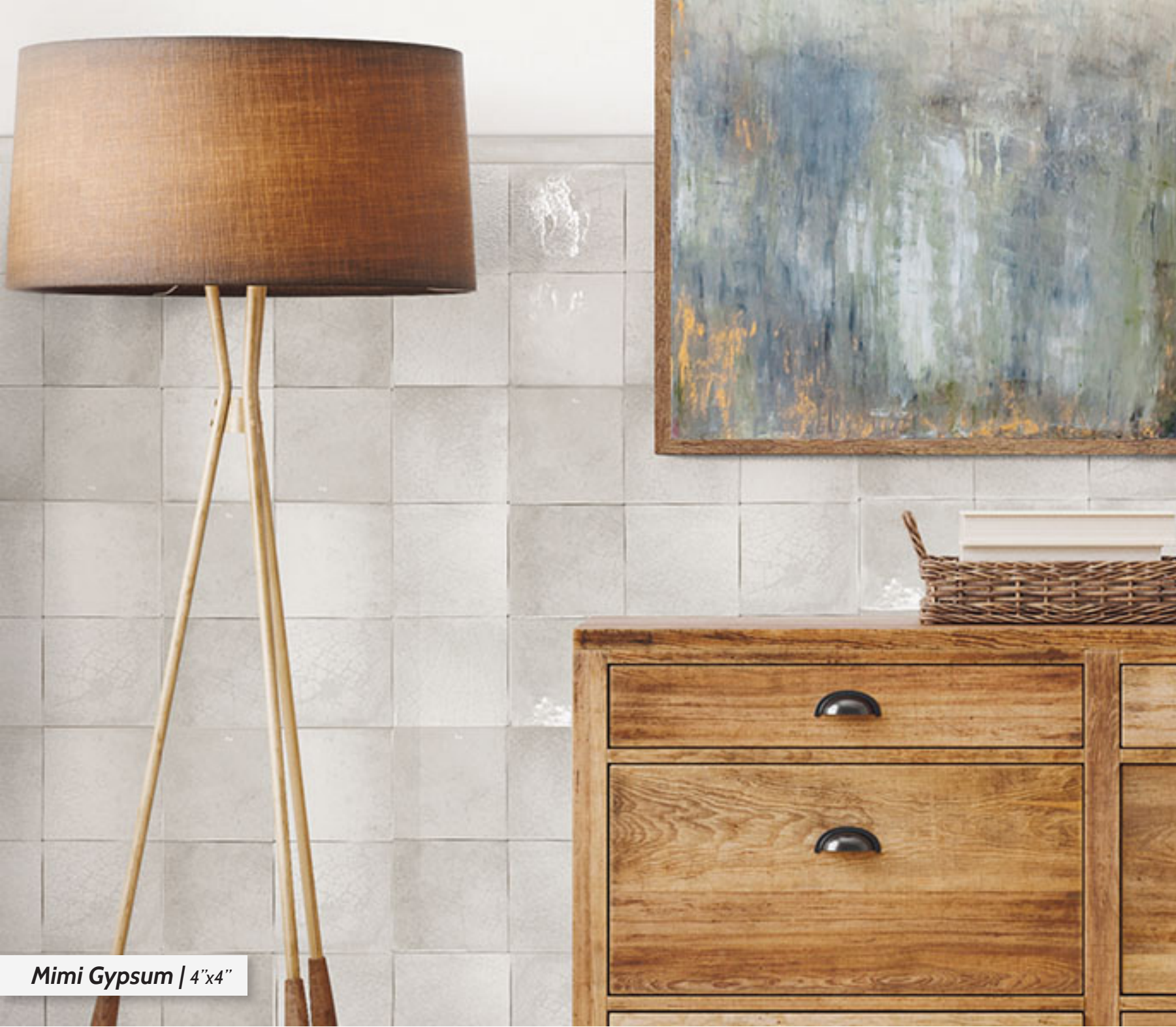
Mimi Gypsum | 4"x4"