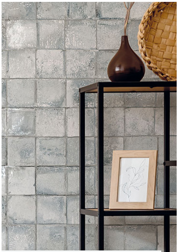
Menta Blue | 4"x4"